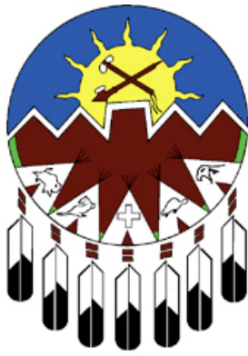
Treaty No. 7