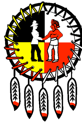
Treaty No. 8