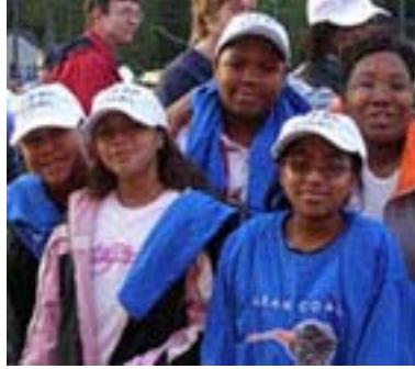
Young supporters at a campaign rally

The sea of supporters cheering their candidate while wearing the ACCCE message was a game changer. We watched as our message was transmitted by shirts and hats waved by thousands of excited supporters from the stands of high school gyms, floors of hotel ballrooms and tables of crowded coffee shops. The pictures of our supporters were caught and broadcast by local and national media, including USA Today and Fox News . Soon our message was repeated back to us from the podium by the candidates themselves.