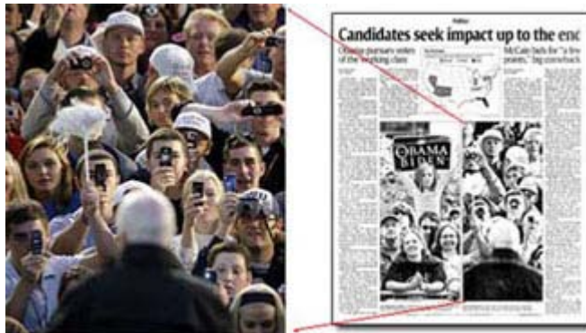
Republican presidential candidate Sen. John McCain addresses a crowd wearing "Clean Coal hats" in Pennsylvania. This photo ran in USA Today on Nov. 3

The program also had an impact on the perception of coal among public opinion leaders. In September 2007, on the key measurement question— Do you support/oppose the use of coal to generate electricity? —we found 46 percent support and 50 percent oppose. In a 2008 year-end survey that result had shifted to 72 percent support and 22 percent oppose. Not only did we see significantly increased support, opposition was cut by more than half.