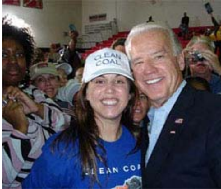
Democratic Vice Presidential candidate Joe Biden with a member of our North Carolina team.