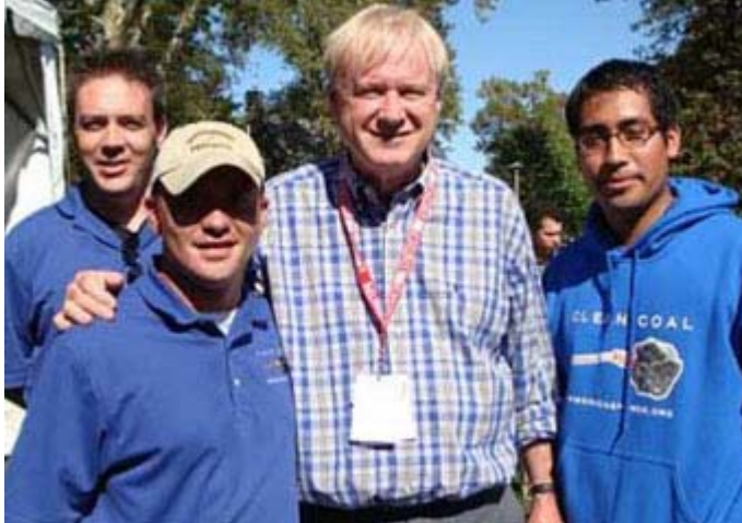
MSNBC's Chris Matthews who sought out our Pennsylvania Clean Coal Team to ask about our efforts.

Building on our existing 200,000-strong grassroots citizen army, we leveraged the presidential candidates' own supporters, finding advocates for clean coal among the crowd to carry our message. We got these on-the-spot advocates to show strong public support to the candidates and to the media, and enhanced that visibility by integrating online media that created even more of a buzz. We did this by sending "clean coal" branded teams to hundreds of presidential candidate events, carrying a positive message (we can be part of the solution to climate change) which was reinforced by giving away free t-shirts and hats emblazoned with our branding: Clean Coal. Attendees at the candidate events wore these items into the events.